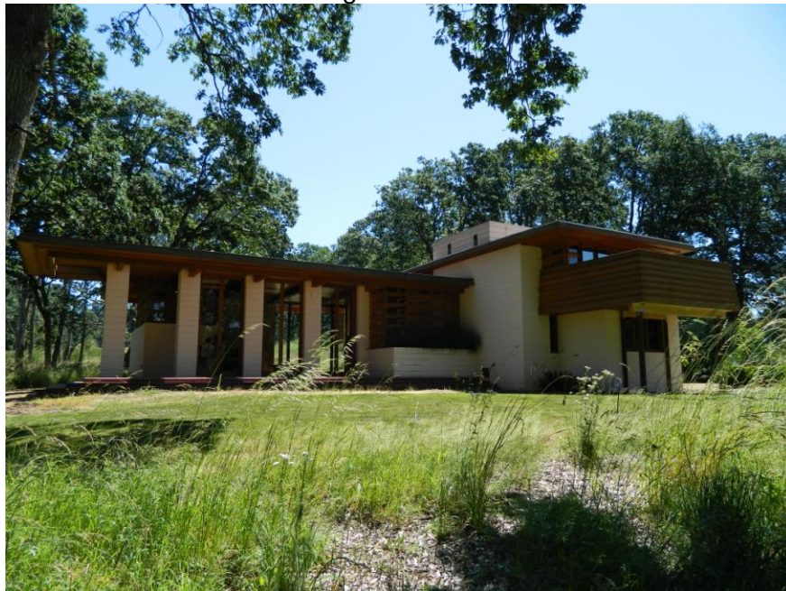
Frank Lloyd Wright House