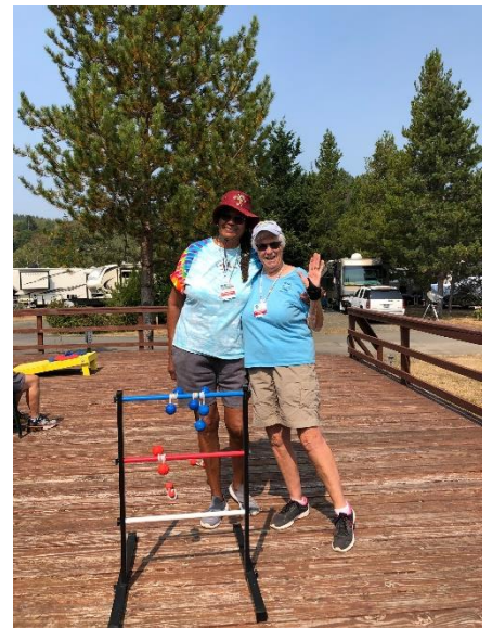
Salmon Festival Tees