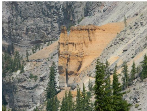
The Pumice Castle