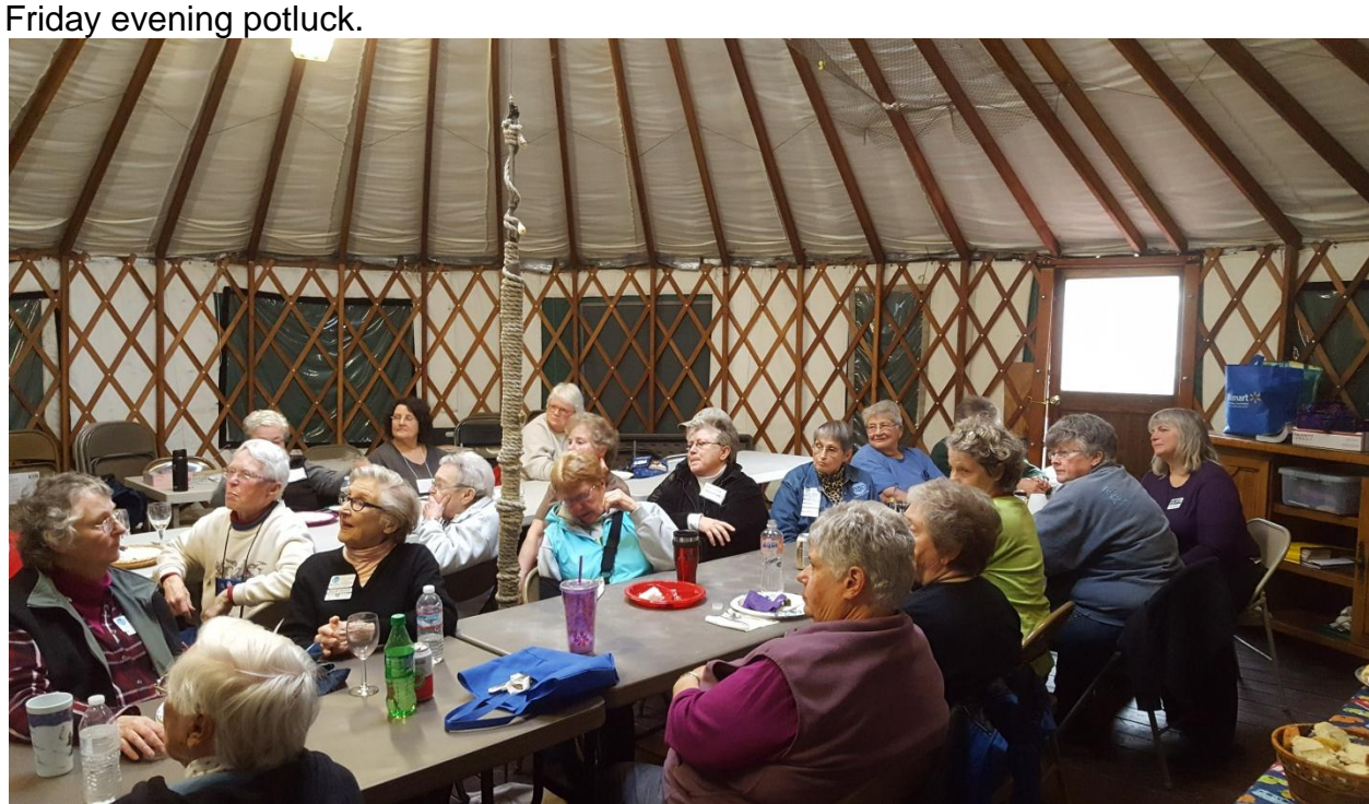
We were pleased to greet some new members as well as our large group of regular attendees.

Well, if it's true what they say about April showers bringing May flowers, Oregon should be blanketed in flowers this year because this was another stormy weekend with over 2.5 inches of rain! The ladies that arrived on Thursday spent the night rocking and rolling in their rigs as high winds, with gusts up to 65 mph or more, started up around 5 AM. But we are a hearty bunch as can be attested to by the number we had at our