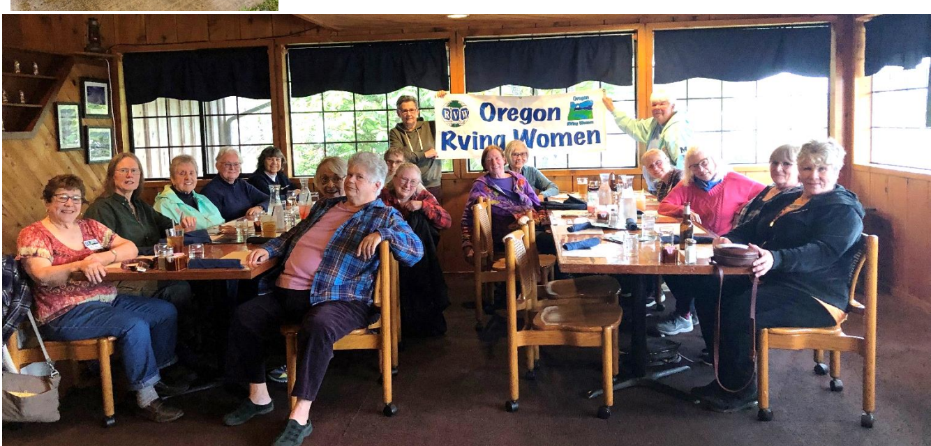
Sunday dinner was at Billy Smoothboar's, a restaurant very close to the park. The food was good, the waitress was very good and the company of friends, old and new, was the best!